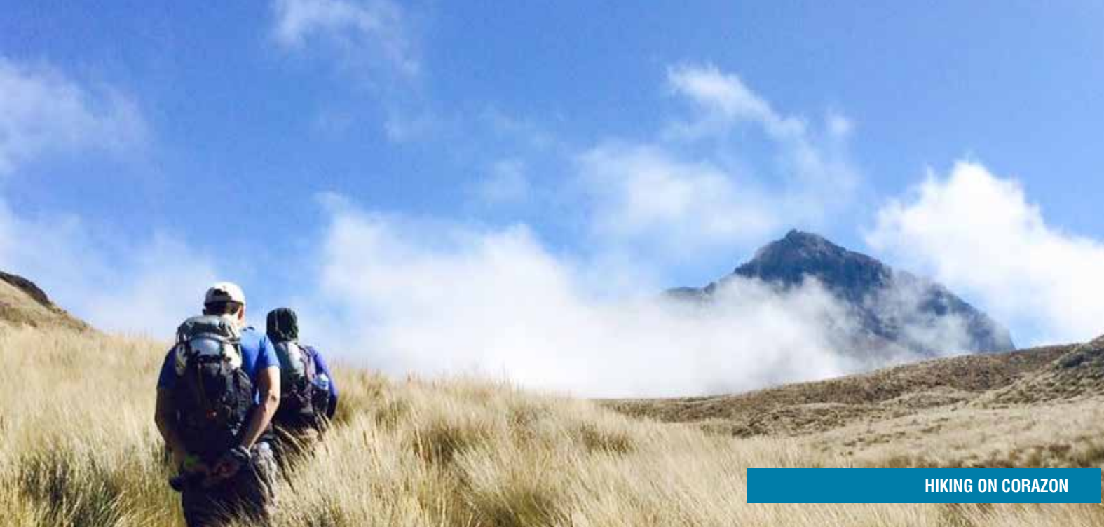
HIKING ON CORAZON

Ecuador is famous for the “Avenue of the volcanoes”, a spine of peaks separating the Amazon from the plains. Within its 300km there are close to 200 mountains and over 70 volcanoes. Our 14 day trip will take you to the top of six, including the two highest peaks in the Ecuadorian Andes - Chimborazo (6,268 m) and Cotopaxi (5,897m).