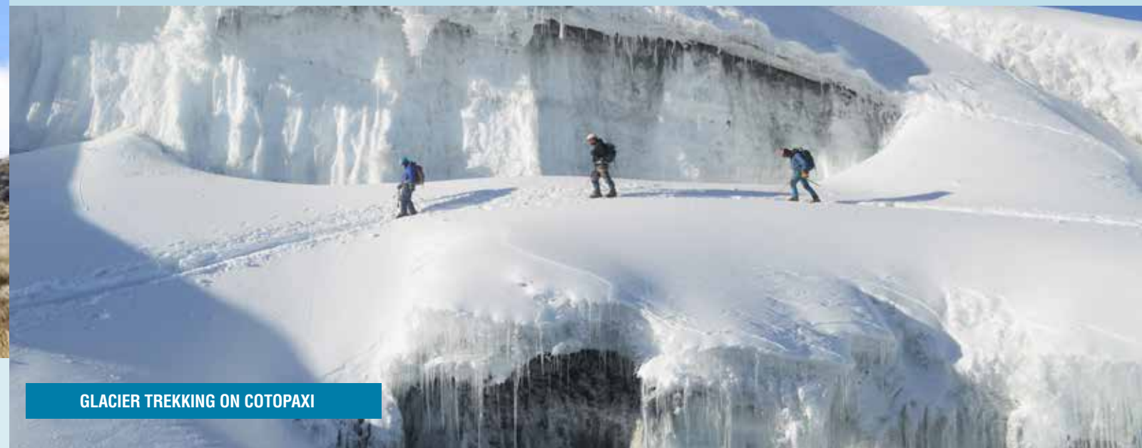
GLACIER TREKKING ON COTOPAXI