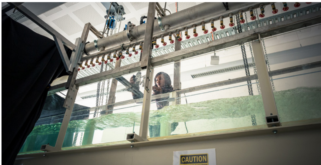
An engineering student at Edith Cowan University.

“This endorsement by the Naval Shipbuilding College means students in WA can quickly and easily identify education options that will fast-track their career in naval