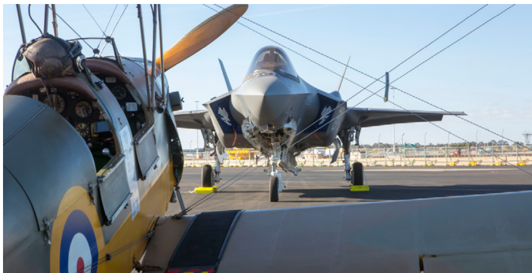
A 1939 RAF DH Tiger Moth and an Air Force F-35A Lightning II on the flight line at RAAF Base Edinburgh.

Chemring Group and Defence have worked closely with the US Navy’s Naval Air System team to qualify Chemring Australia as the second source supplier of the MJU-68 countermeasure and MJU-61 training flares since 2011.