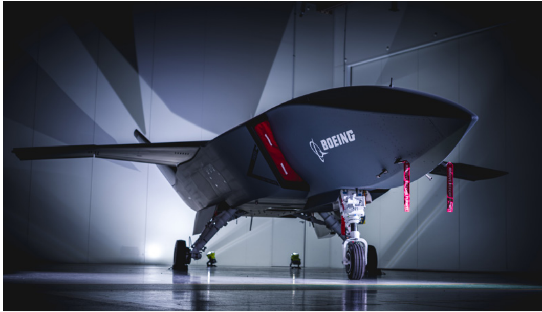
The first Airpower Teaming System has been presented to the RAAF.