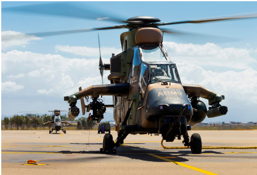
Airbus Helicopters’ Australian presence is built around the Tiger and Taipan helicopters.