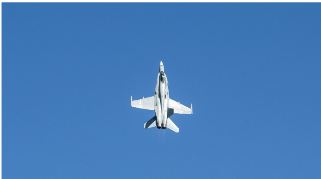
Eight Classic F/A-18A/B Hornets will be retained for heritage purposes.

If all these options were to be taken up, it would account for all 71 of the RAAF's surviving Hornets, leaving none to be allocated to museums for preservation and display. However, Defence has confirmed that eight aircraft will be retained for heritage purposes, including six single-seat F/A-18A Hornets (A21-22, – 23, – 29, – 32, – 40, – 43) and two twin-seat F/A-18Bs (A21-101 and – 103).